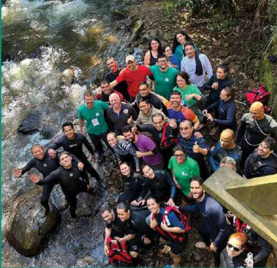
BRAZIL Volunteers meeting for water rescue training.

The aim of increasing the resilience of our volunteers and the societies in which they operate resulted in a fantastic experience of harmonious coexistence, learning and unity among the participants.