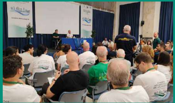
ITALY Training sessions on self-protection against hydro-meteorological risks.