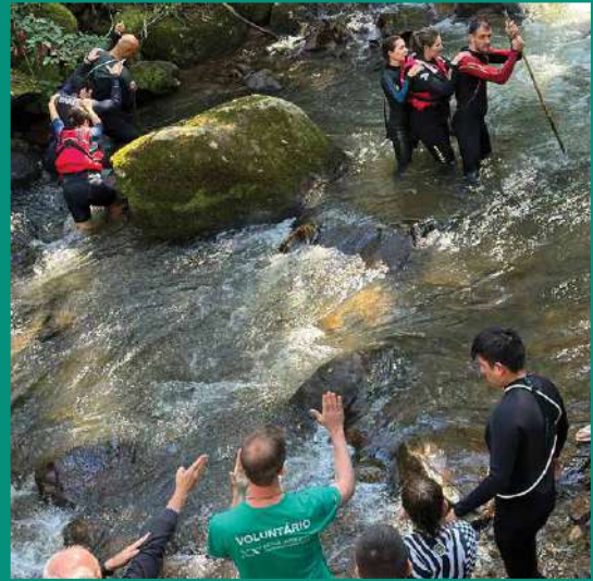
BRAZIL Water rescue training.

The events took place at Campo San Jorge, Brazil, and in Syracuse, Sicily, Italy. They brought together 300 volunteers from 28 countries where New Acropolis is active, who received theoretical and practical training in self-protection measures against hydrological risks, emergency plans and applied philosophical values.