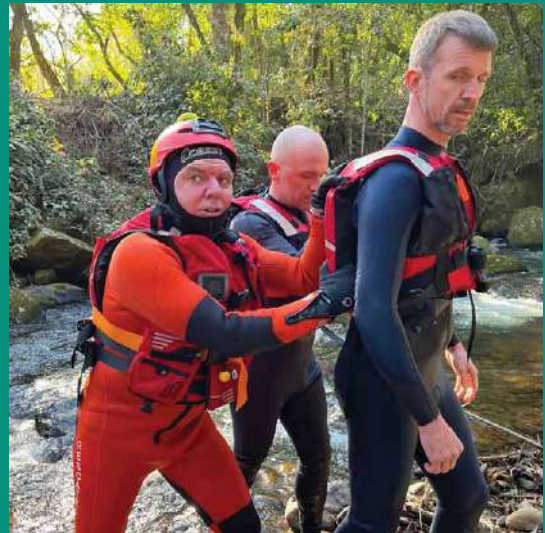
BRAZIL Water rescue training.