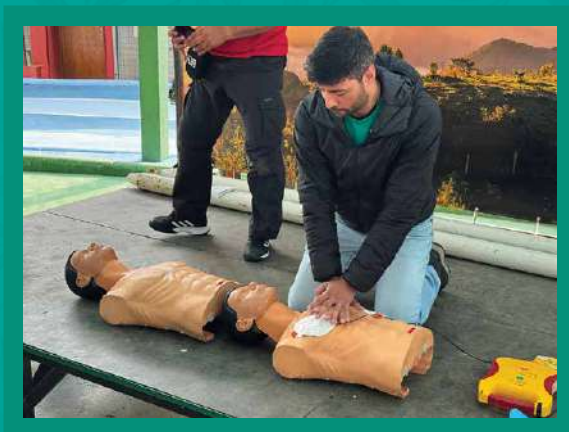
BRAZIL Rescue and first aid courses.