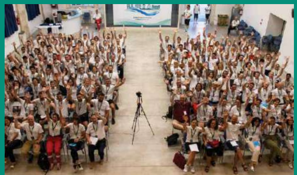
ITALY Volunteers meeting during the Volunteering Event.