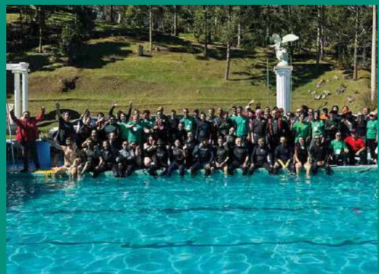
BRAZIL Volunteers meeting for water rescue training.