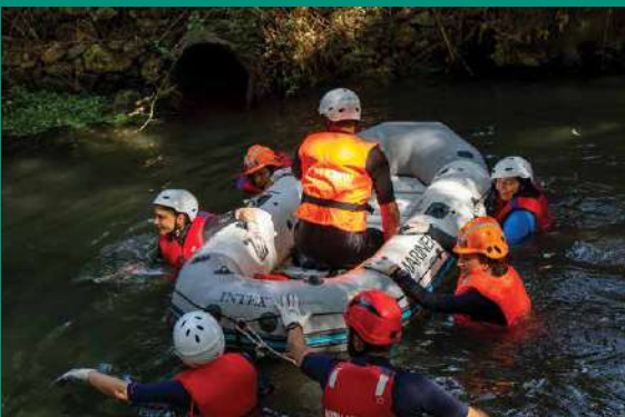
ITALY Water rescue training.