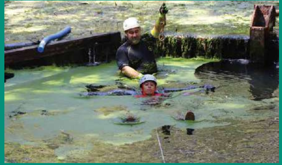
ITALY Water rescue training.