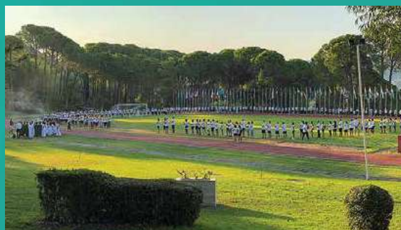
Opening of the event, with delegations from all countries.