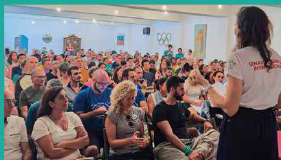
Presentations, lectures and cultural tours of Greek monuments.