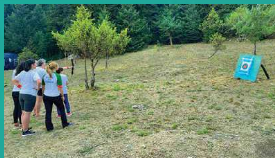
Sports activities: volleyball, chess, archery, among others.