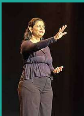
Artistic presentations from different countries: music, theater, dance.