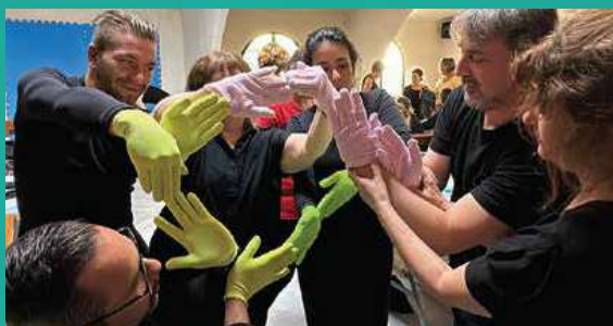
Artistic classes and workshops.