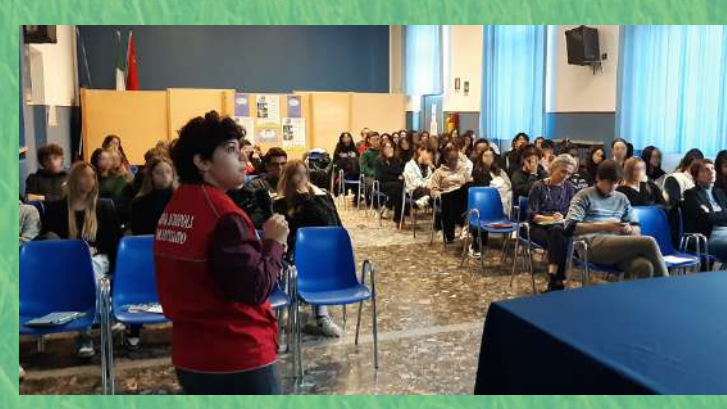
At the "L. Einaudi" State Technical-Economic Institute in Verona, volunteers from New Acropolis and representatives of the City Council presented two educational projects to